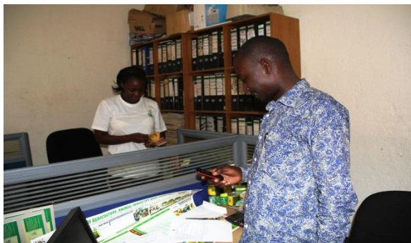
FICA Seed marketing manager receiving the navments from MYANZI ACE representative

O n Friday 7 th March, farmers from Kitumbi and Myanzi ACEs purchased improved bean seed in bulk as cooperatives. The improved seed is for production of 32 MT grade 1 bean grain