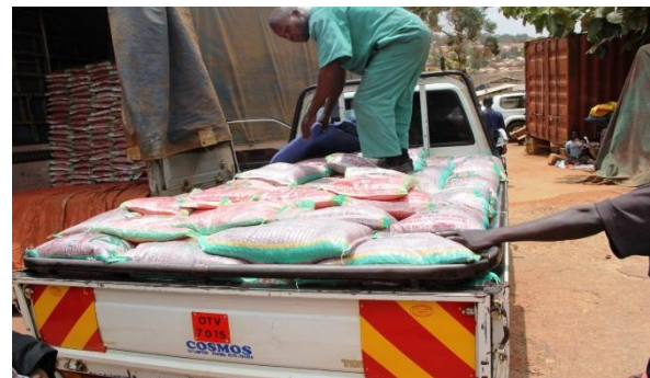
Verified bean seed packed and ready to be delivered to MYANZI ACE

F ICA Seeds has also committed to set up a demonstration site in Kitumbi of NABE 15, to ensure that the farmers have full evidence of the yield and economic value of using improved bean seed. Because of this gesture by FICA Seeds, farmers who were waiting to see if FICA Seed is a trustworthy company are already placing orders for their own improved seed.