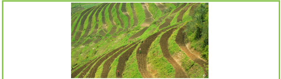
Fig 2: Terracing for sustainable agriculture production in Rwanda