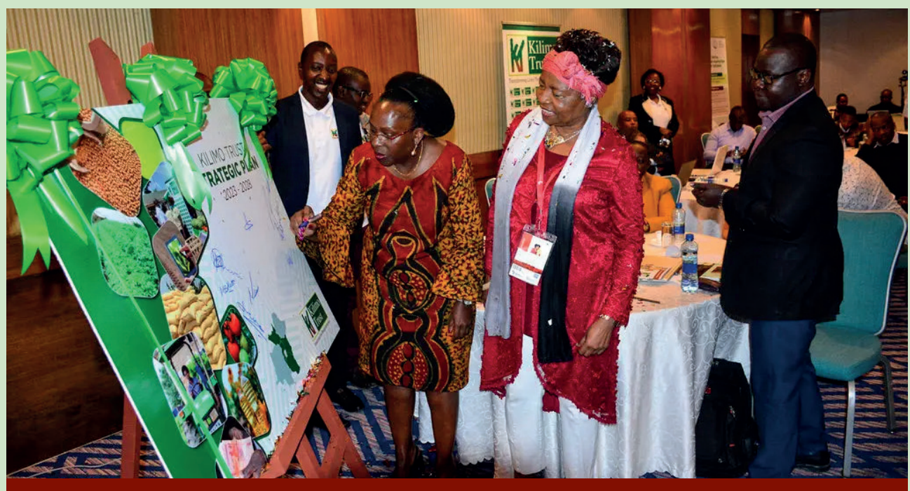
On Tuesday 05th September 2023, Kilimo Trust, a not-for-profit organization working on agriculture for development in East Africa launched its new five-year strategic plan (2023 – 2028) in a colorful ceremony at the Four Points by Sheraton Hotel in Dar es Salaam, Tanzania.

The launch event was graced by dignitaries from the Ministry of Agriculture of Tanzania, Agricultural Research Institutions from the region, funding partners such as The IKEA Foundation, Rockefeller Foundation, the International Fund for Agricultural Development (IFAD), MasterCard Foundation, Kilimo Trust Board of Trustees, and management. Kilimo